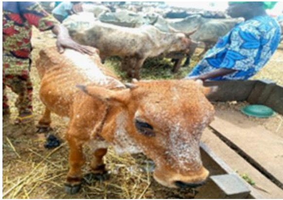
Figure 7: (Infected cow and carefree handlers)

workers. On the other hand, gender does not necessarily determine bacterial infections of abattoir workers.