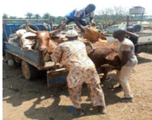
Figure 3: Loaders (Loading bay)