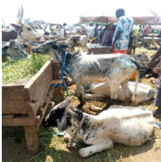
Figure 5: ( Sick , malnourish with septic skin blister)

workers. However, the table indicates that gender ( \beta = -0.067 ; t = -0.649 ; p > 0.05 ) have no significant relative contribution to bacterial infections of abattoir workers. The implication of this result is that nature of work is a strong predictor of bacterial infections of abattoir