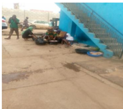
Figure 6: (Gut cleaner at work)