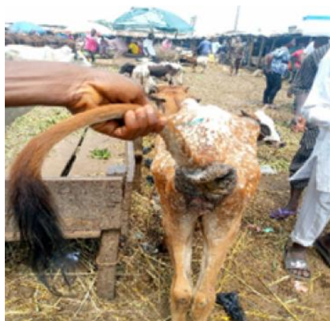
Figure 4: (budded, bleeding infected anus)